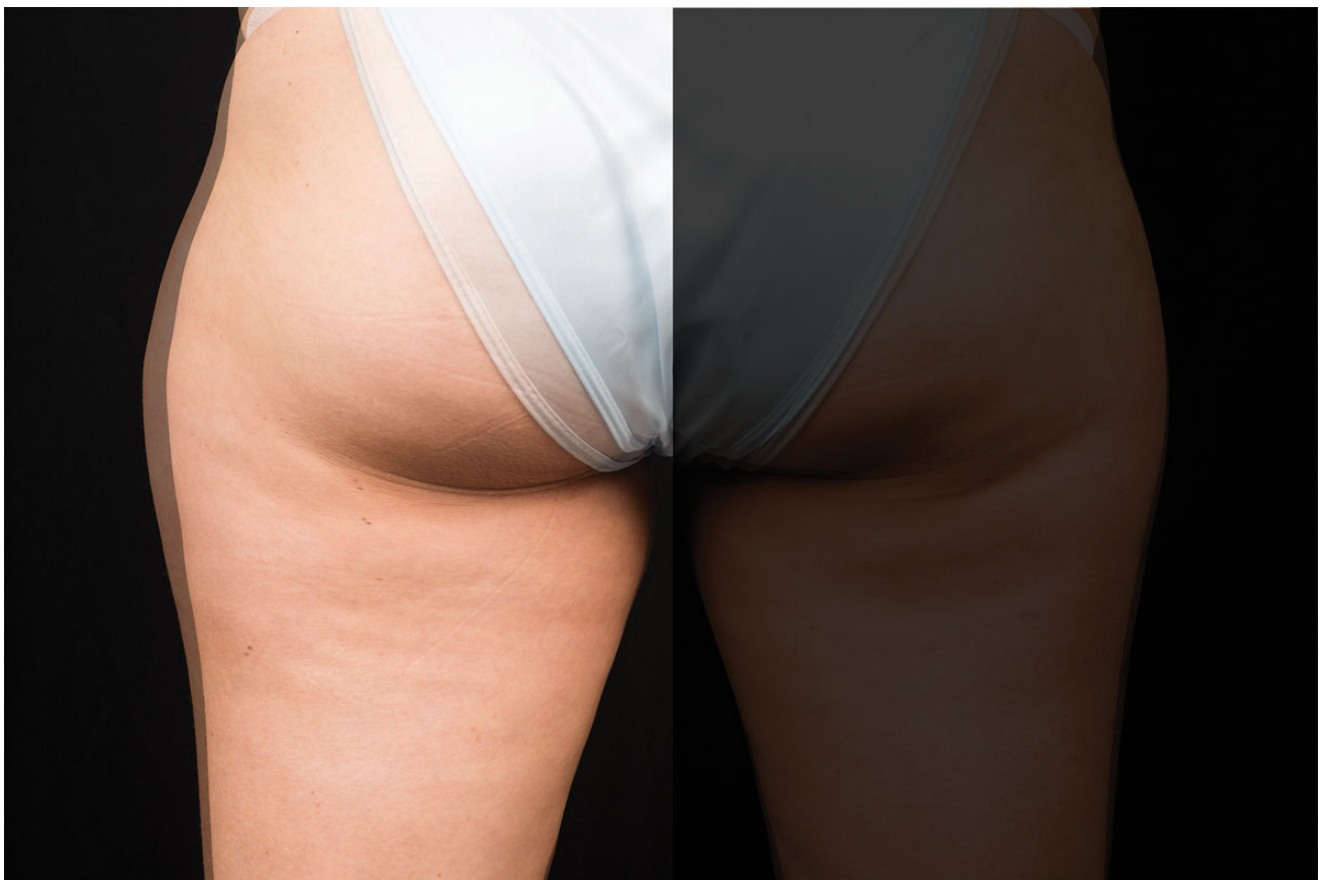
Figure 4. This 41-year-old woman underwent unilateral cryolipolysis of her left thigh to reduce subcutaneous fat. The photographic overlay of baseline and 8-week images shows visible reduction in lateral thigh curvature. The patient gained 5.0 lbs since baseline. (Procedure performed by Dr Grant Stevens, Marina Plastic Surgery.)

Cryolipolysis vacuum applicators have been utilized in numerous clinical studies. The controlled, noninvasive cooling of subcutaneous fat associated with these devices has been shown to be safe in studies of peripheral nerve function, serum lipid levels, and liver function tests. 20,21