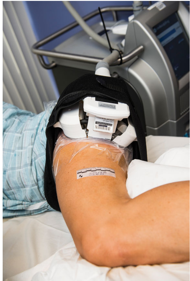
Figure 1. Each patient was placed in the lateral recumbent position, and the conformable-surface applicator was secured over the lateral thigh throughout the 120-minute unilateral cryolipolysis treatment.

Subjects were placed in a lateral recumbent position on Velcro straps. The surface applicator was then securely attached to the patient by the straps (Figure 1). Each subject received 120 minutes of treatment via the prototype applicator to 1 thigh (eg, unilaterally), and the contralateral